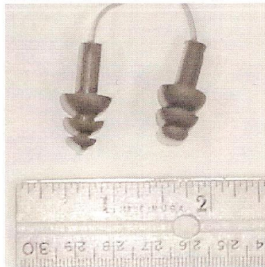
Test Item: Q936A

These data were obtained through measurements made at the laboratories of Michael & Associates, Inc., State College, PA , USA. Michael & Associates, Inc., is accredited to test to ANSI S3.19-1974 and ANSI S12.6-1997 by the National Institute of Standards and Technology (NIST) National Voluntary Laboratory Accreditation Program (NVLAP).